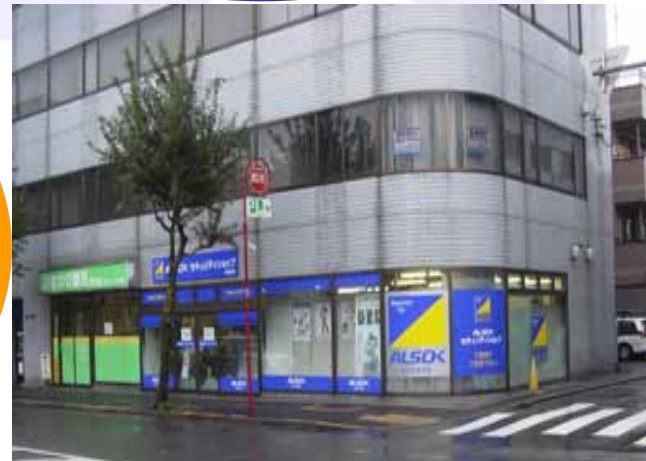
ALSOK Security Shop -Machida-