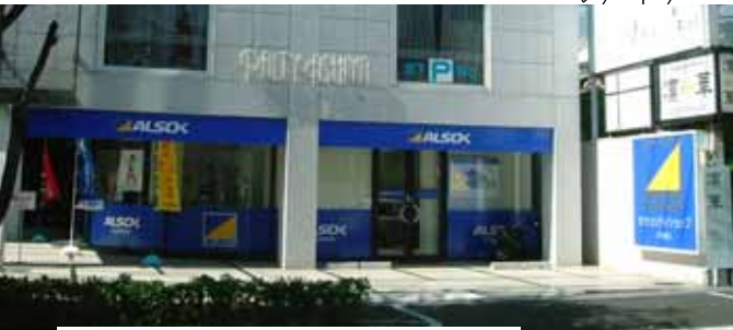
ALSOK Security Shop -Ashiya-