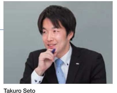
PR Section (I), PR Department

"Security Services and Planning" for the 2020 Summer Olympic and Paralympic Games