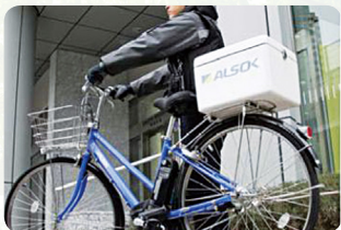
Bicycle introduced to reduce fuel usage