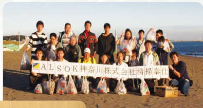
Volunteer cleanup activities along Enoshima coastline in Kanagawa Prefecture

inspiring a citizen-driven environmental preservation movement leading up to the Olympic and Paralympic Games Tokyo 2020. The Group will continue aiding the activities of the NGOs and NPOs to support the Olympic and Paralympic Games Tokyo 2020 from an environmental perspective.